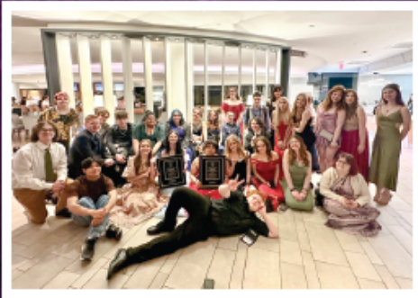
Hannibal High School students gather for a group photo in Washington, D.C.

Hannibal High School student musicians recently took their talents on the road, performing in Washington, D.C.