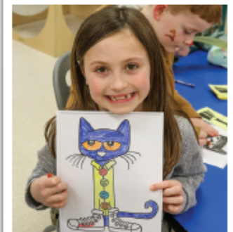
Students enjoy activities during a recent literacy night.