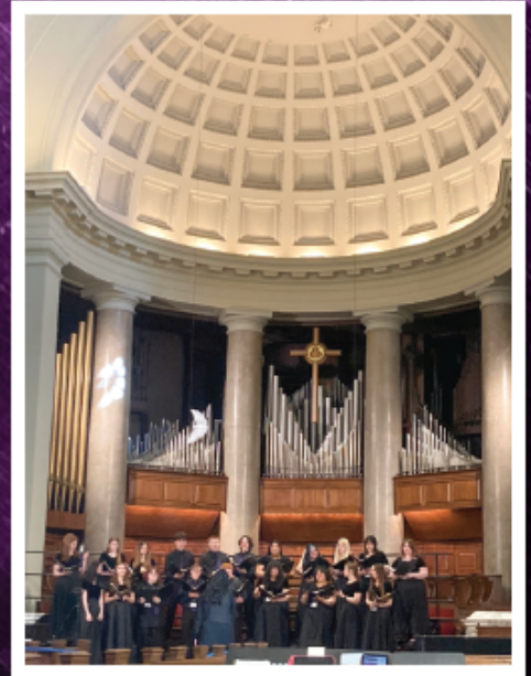
The Hannibal High School choir performs in Washington, D.C.