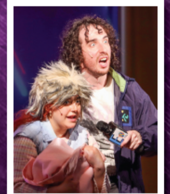
Actors from The Rev Theatre Co. deliver a showcase Echoes performance at Dennis M. Kenney Middle School.